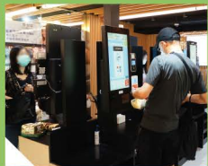
自助結帳系統 Self-service kiosk