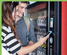
自助售賣機 Vending machine